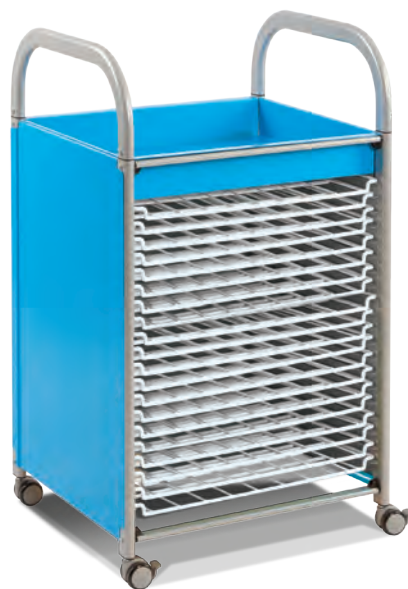
20 Drying Racks