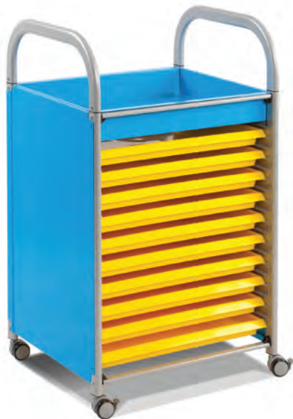
10 Art Trays